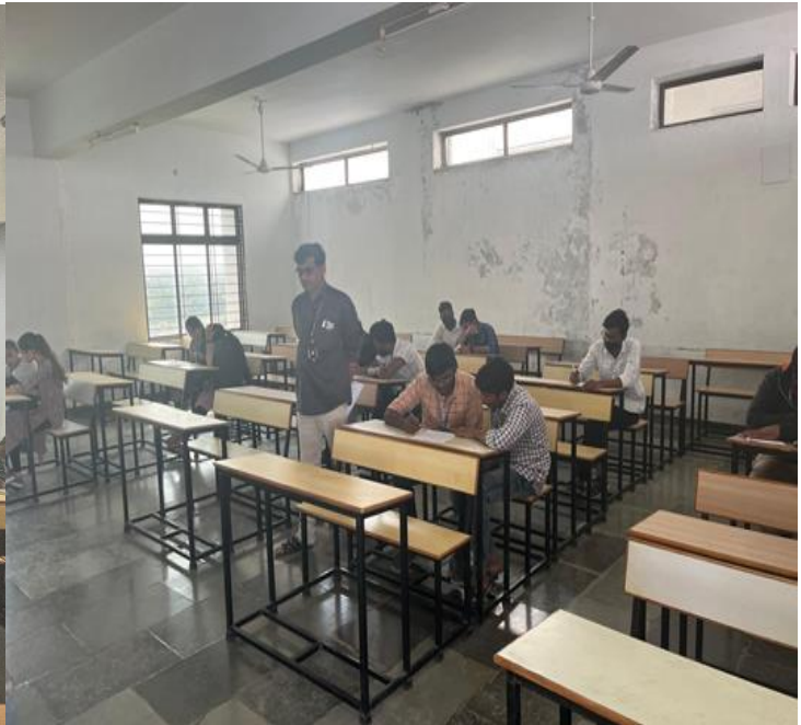
Students participated in Quiz Competition