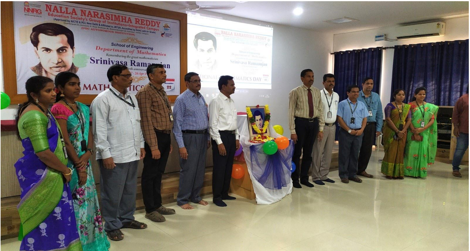
Mathematics faculty group photo with the Director, Dean and Departments HODS