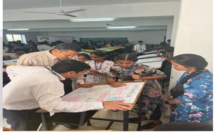
Judges visiting poster presentation competition