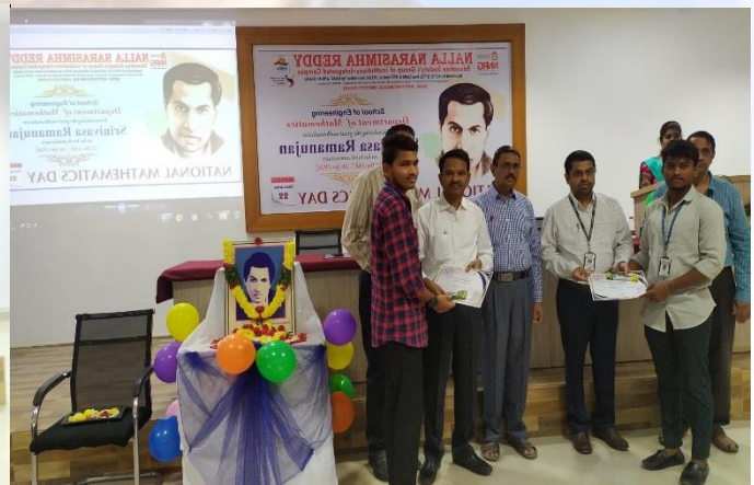
Prizes distribution by the Director, Dean, and HODs