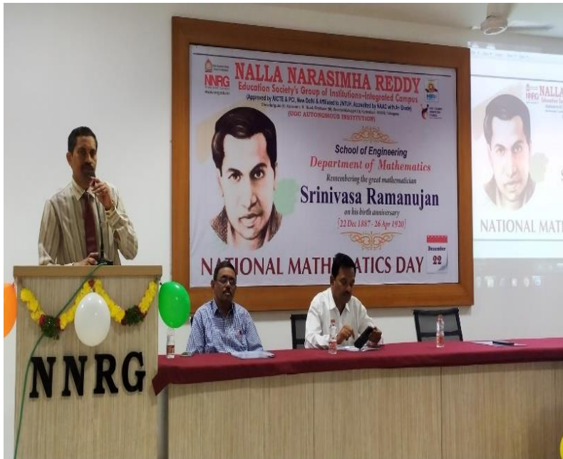
Dean Sir addressing the students