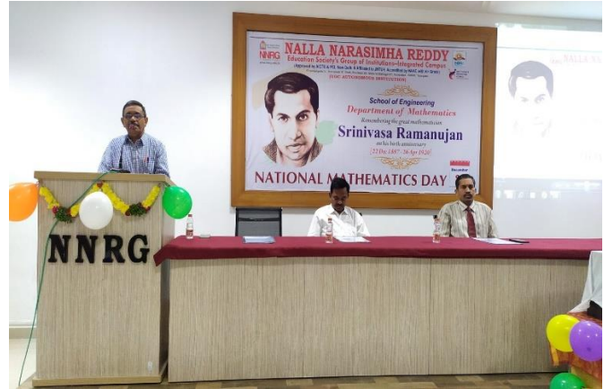
HOD (H&S) Sir addressing the students