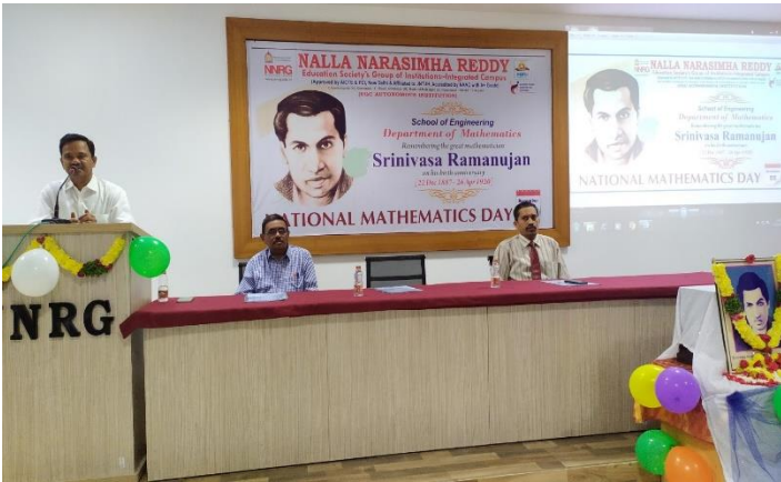
Director Sir addressing the students

Watching video presentation of Srinivasa Ramanujan Life History and few applications of mathematics” By The Director, Dean, HODS and I-B.Tech students