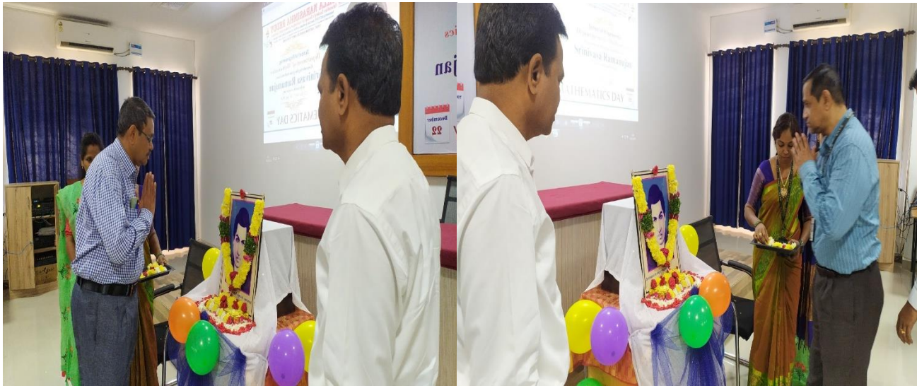
Garlanding srinivsva ramnuan photo by the Director,Dean,HOD of H&S and HOD of Civil.