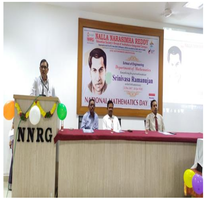
Faculty addressing the students